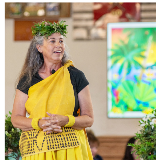
Photo: Halau O Kanahela group member.

100% of the proceeds will directly benefit Crafton Hills College to help students overcome financial barriers and enhance programs.