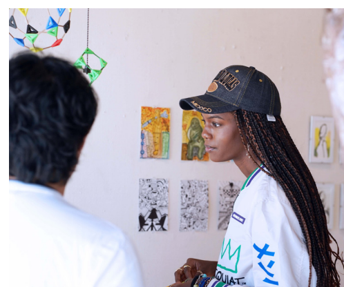
Photo: Students enjoy artwork at reception.

A well-attended reception was held on August 28. Visitors were able to talk with many of the artists about their works. The exhibit ran through September 11.